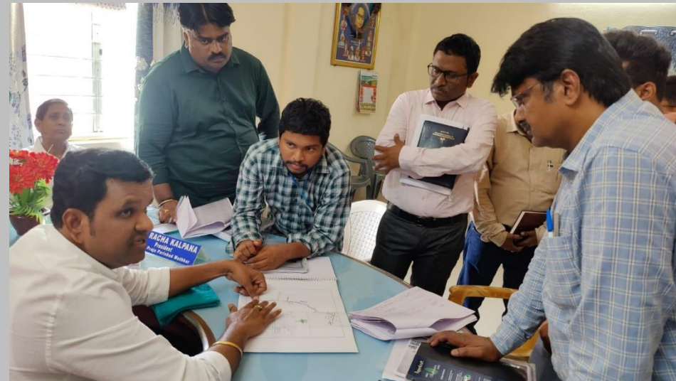
Development works presentation in Mothkur Municipality with Engineering Department to MLA Gadari Kishore gaaru

Site Visit of Hon'ble MLA Sri Methuku Anand gaaru for Mini Stadium in Vikarabad