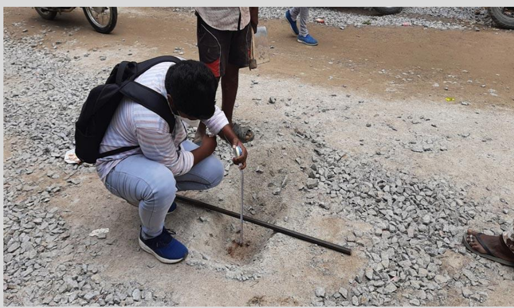
Checking the Wet Mix Macadam Road Under progress