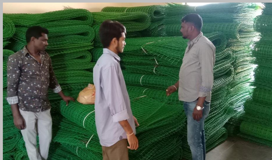
Factory Inspection Carried out for Checking the Mesh