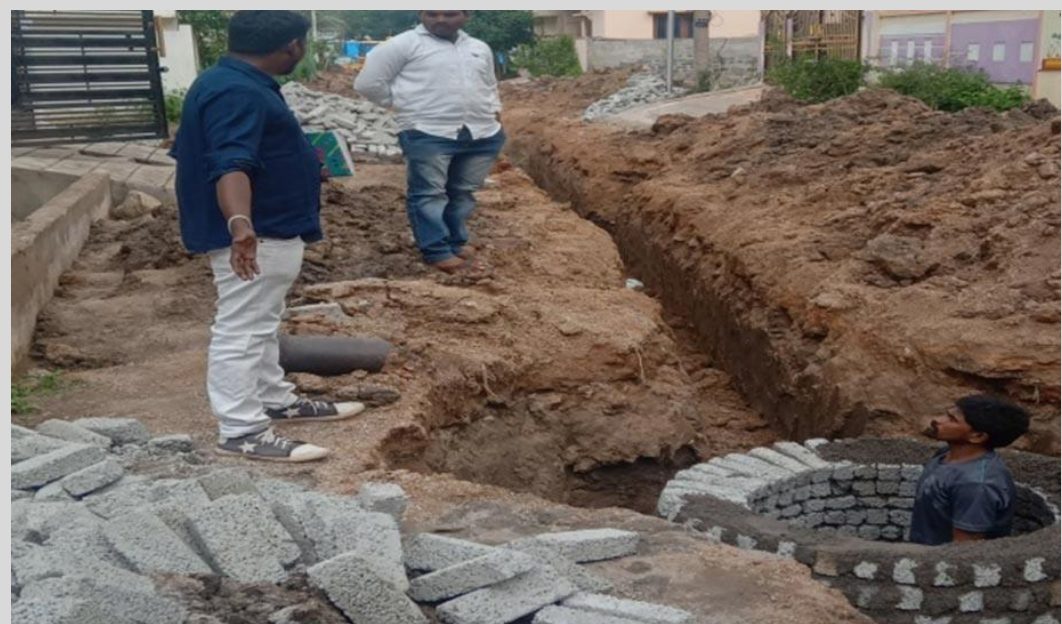
Site Inspection Carried out for Under Ground Drainage

Checking the Bituminous Macadam Content test at Laboratory